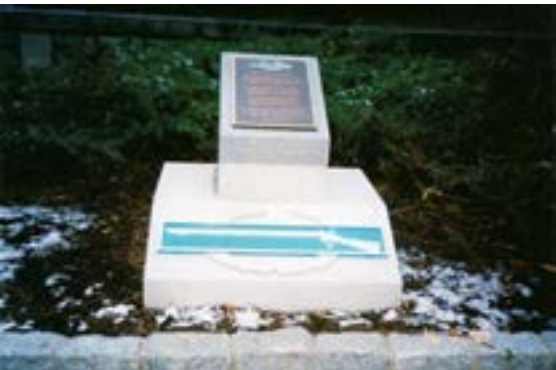
A full picture of the monument is shown at the left. The monument was placed at the Capitol Museum in Albany, NY. The right photo shows NYS Commander Dom Esposito shaking hands with one of the visiting dignitaries.