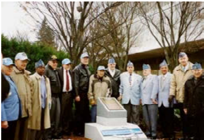
Members of the New York State Combat Infantrymen's Association gather around the monument. Many of these loyal members regularly attend the CIA Convention.